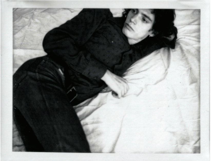
Photo: Untitled (Self-Portrait), c. 1972 © Robert Mapplethorpe Foundation. Used by permission.