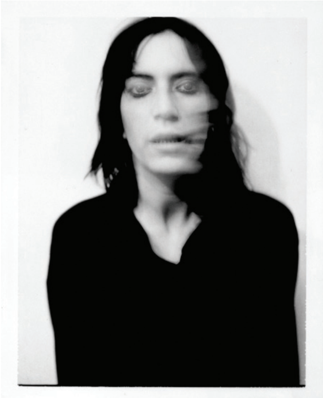
Photo: Patti Smith, c.1973 © Robert Mapplethorpe Foundation. Used by permission.