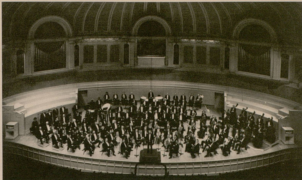
At home in Orchestra Hall.

Three distinguished conductors headed the Orchestra during the following decade: Désiré Defauw was music director from 1943 to 1947; Artur Rodzinski assumed the post in 1947-48; and Rafael Kubelik led the Orchestra for three seasons, from 1950 to 1953.