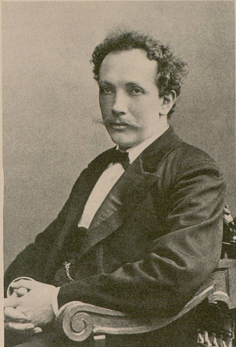
Richard Strauss (1905)

Then Strauss turns the page, draws us round him once again, and reminds us that this is only a tone poem. And, with a smile, he closes the book.