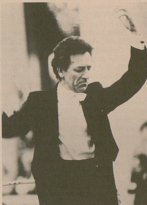
Yuri Temirkanov, Music Director

The Leningrad Philharmonic Orchestra now performs its fourth Ann Arbor concert. Earlier performances were in 1962 under Mravinsky and two concerts in 1973 under Gennady Rozhdestvensky and Neeme Järvi.