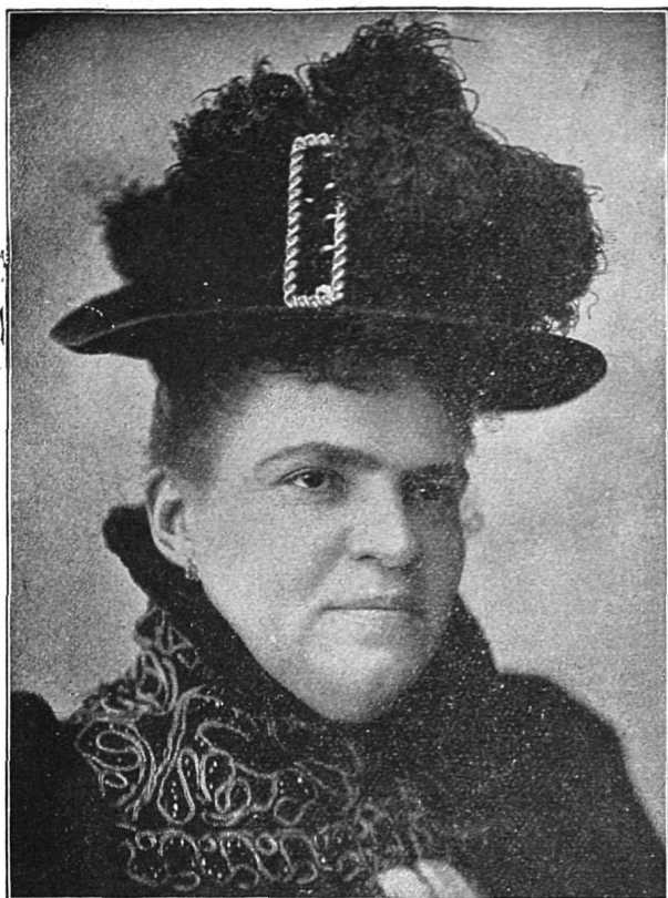
THE WORLD'S GREATEST CONTRALTO.

The concert and opera last night by Mme. Scalchi and her fine company excelled any given here in the past thirty years.—Portland Press, October 25, 1898.