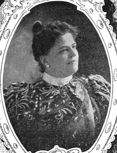
MME SOFIA SCALCHI.