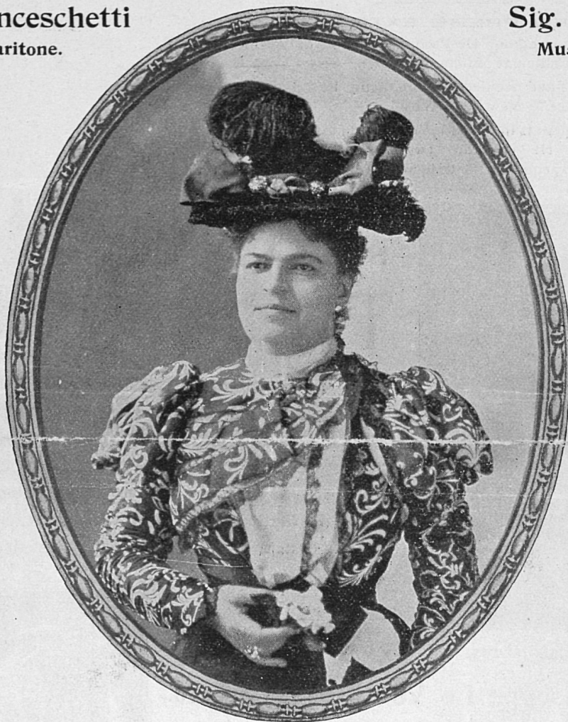
THE WORLD'S GREATEST CONTRALTO.