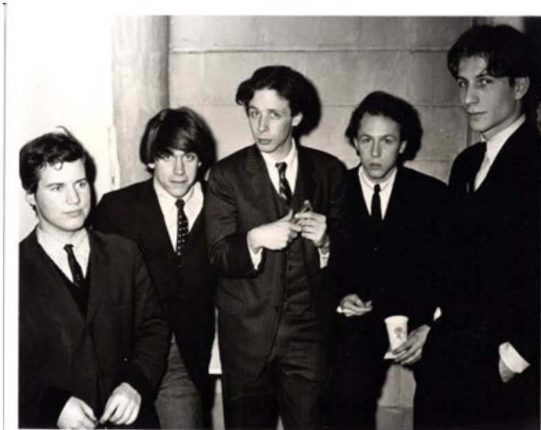
The Prime Movers circa 1966

OriginalGroup.jpg (95.62 KiB) Viewed 1407 times