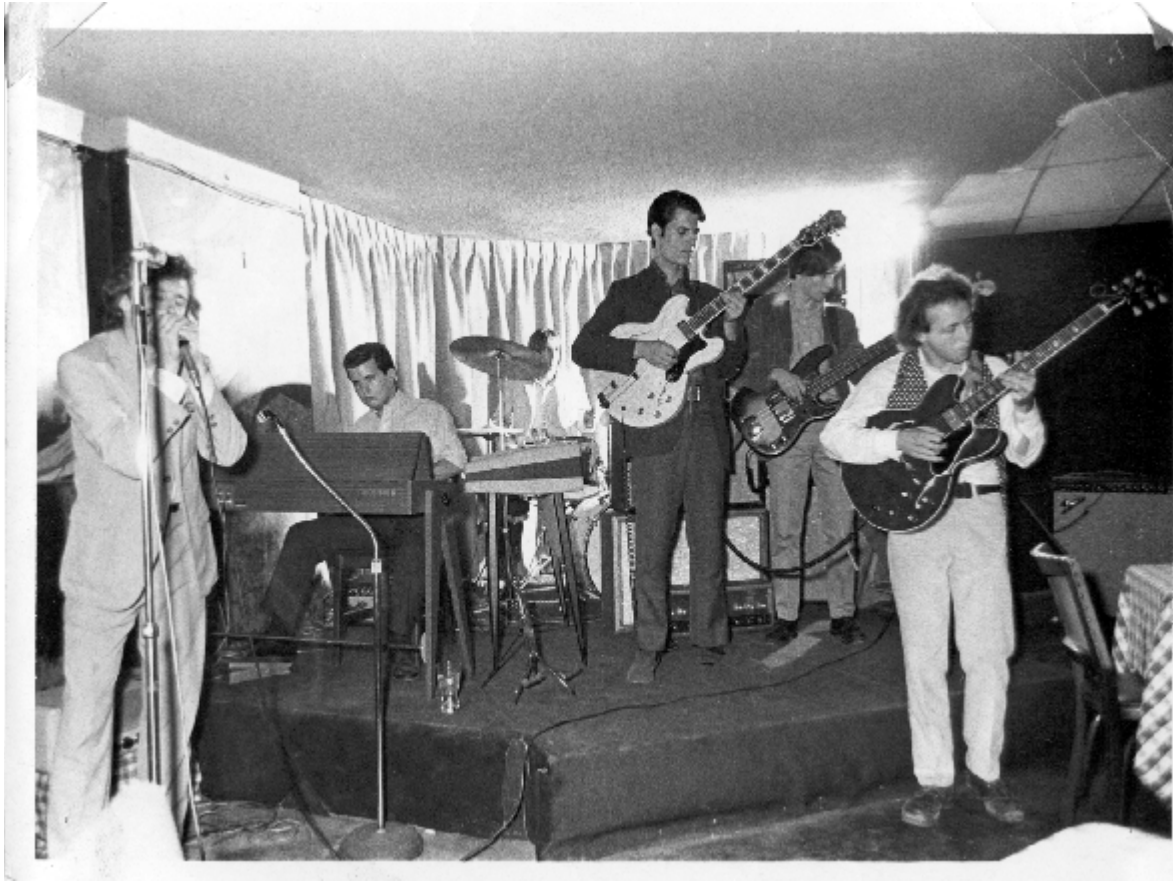
The Living End in Detroit 1966

LivingEnd.gif (275.59 KiB) Viewed 1409 times