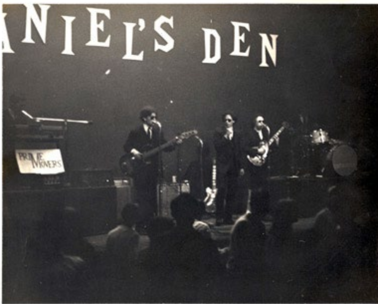
Prime Movers at Daniels Den