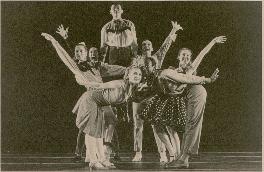
“GOING AWAY PARTY” – Mark Morris Dance Group