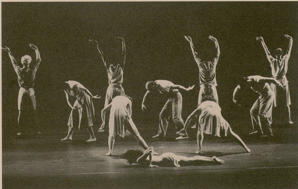
"GLORIA" – Mark Morris Dance Group