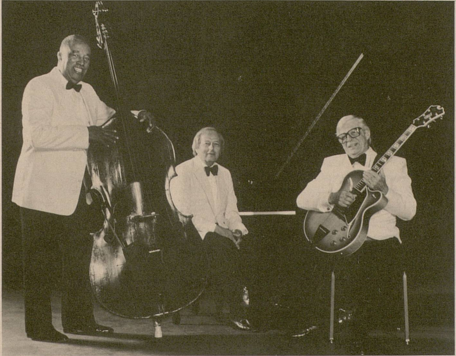
André Previn, Piano Mundell Lowe, Guitar Ray Brown, Bass

Saturday Evening, February 13, 1993, at 8:00 Hill Auditorium, Ann Arbor, Michigan