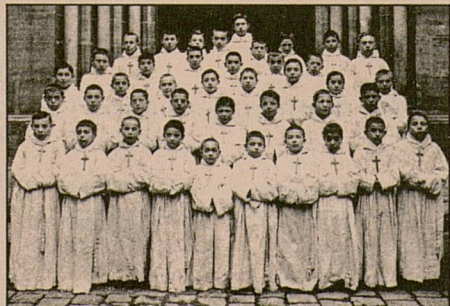
1908: The first Little Singers

It all started more than 80 years ago, in 1907, when a few Parisian students felt the desire to revive the medieval tradition of religious boys choirs, which had been somewhat forgotten in the course of the centuries.