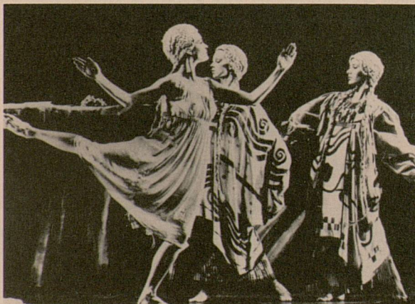
L'après-midi d'un faune